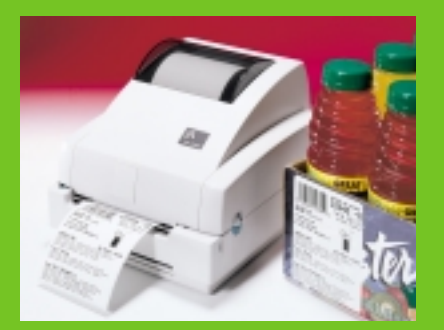
Zebra printers hit the spot! You'll enjoy using the LP 2742 (pictured above) and TLP 2742 in applications such as retail.